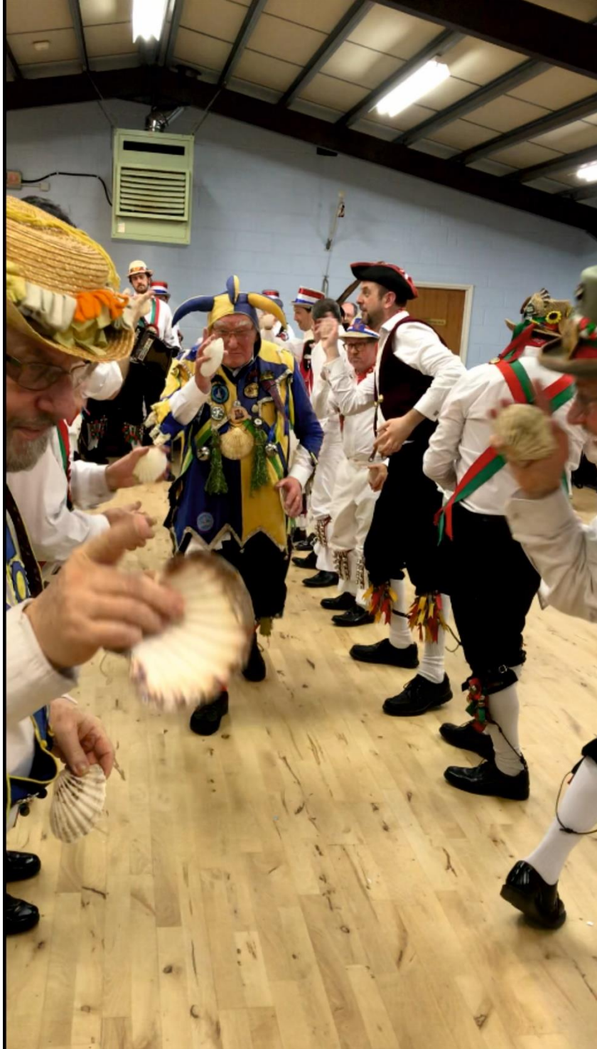
The Kennet Ale (a pre lockdown event) The crazy shell dance.

Almost the whole of the dancing season was cancelled due to COVID