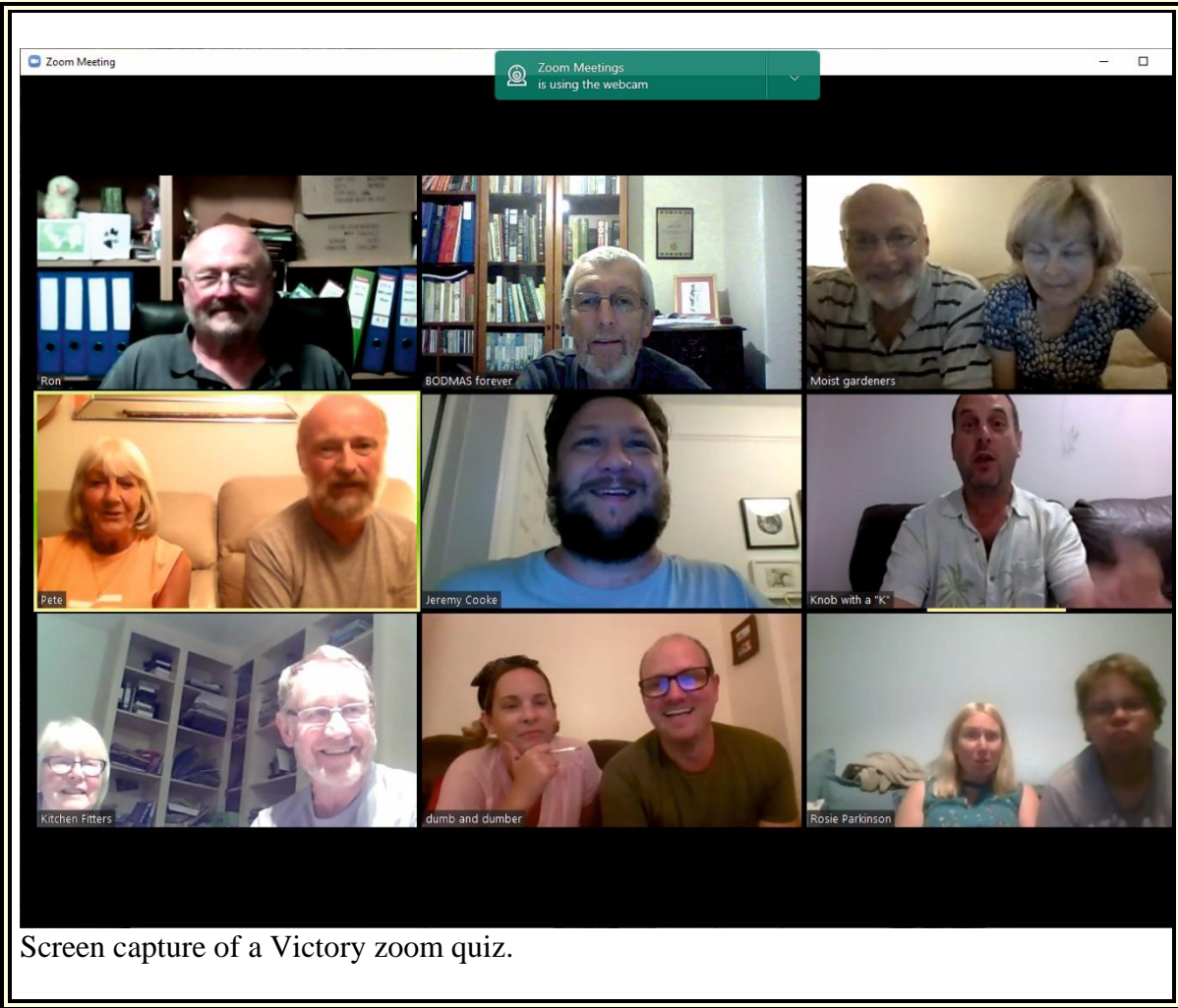
Screen capture of a Victory zoom quiz.